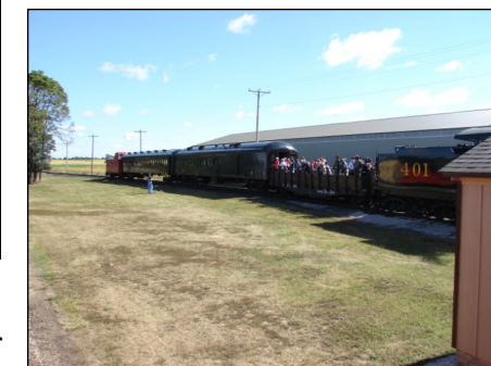
On September 20th and 21st the Annual Railroad Days was held to a record crowd of attendance. The weather enhanced the festivities of a day of railroading with the presence of steam, diesel and motorcar. The CN FP-A no. 6789 would pull the Illinois Central consist of passenger cars and observation car as the steam locomotive 401 would handle the vista flatcar accompanied by the IC combine, RI coach and Wabash caboose. The Illinois Central GP11 No. 8733 would handle the derrick and caboose as the motorcars made intermediate runs, To assist guests to the Camp Creek Yard area, the MILW NW2 no. 1649 ran as the "yard hop". At Crisp Park, the Hodge cars provided opportunity for younger railfans to ride on the Crisp Shortline RR.